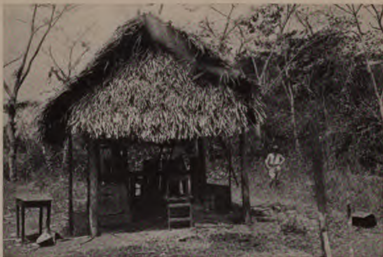
B. touched a match to the thatch roof